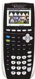
TI-84 Plus C Silver Edition $100 - $125