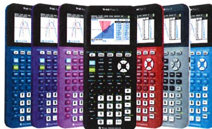
TI-84 Plus CE $110 - $150

Note: It does NOT matter which model of this calculator you purchase. Any TI-84 Plus calculator will serve our purpose. Some graph in color and have better graphics and some have a rechargeable battery pack. All of these calculators are approved for PSAT, ACT, SAT, and college placement exams.